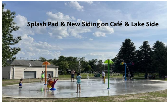
Splash Pad & New Siding on Café & Lake Side